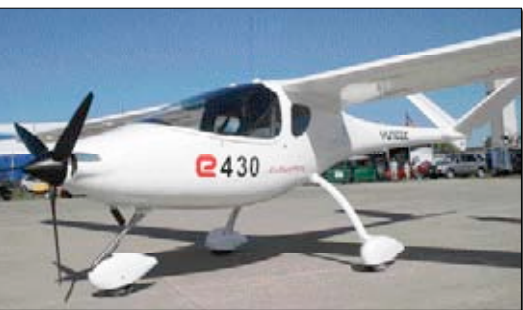
The Yuneec E430 from China appeared last June. It's LSA eligible, and may fly for 2.5 hours on a charge.

I was fortunate enough to attend the third CAFE Electric Aircraft Symposium, held at the Hiller Aviation Museum in San Carlos, California, on April 24, 2009. The estimated 150