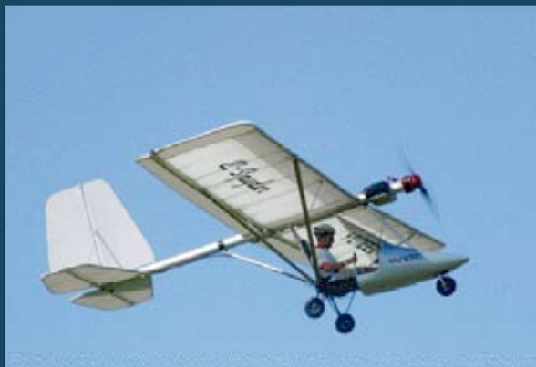
Tom Peghiny shows the Yuneec ESpyder in multiple trips around the ultralight pattern.