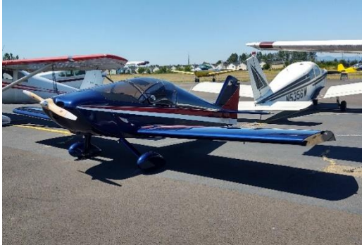
Russ VanLandingham's Sonex is Light Sport