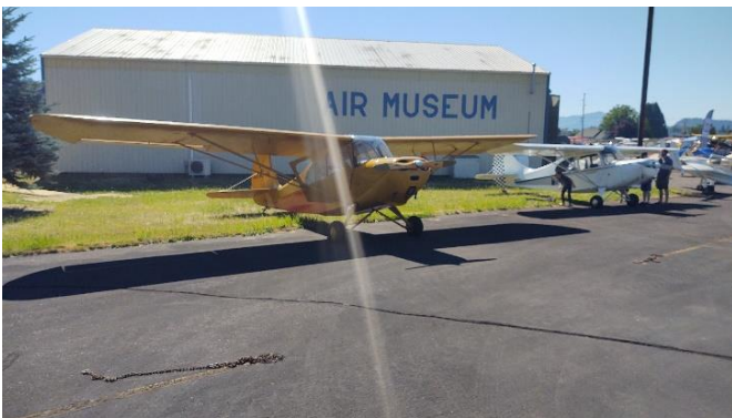
Curt Cowley's Champ