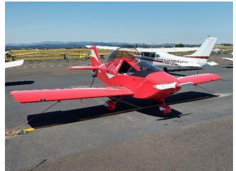
Mike Kelley's 6 cyl, 120 hp Sonex is still considered Light Sport.