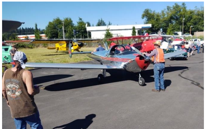
Pat Hatfield's Ercoupe (nicely polished!)