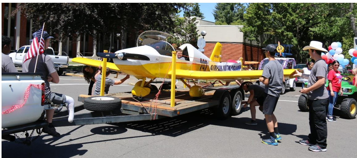
Vince Homer's Onex display on the flatbed trailer! Kolby Taylor is at the controls!