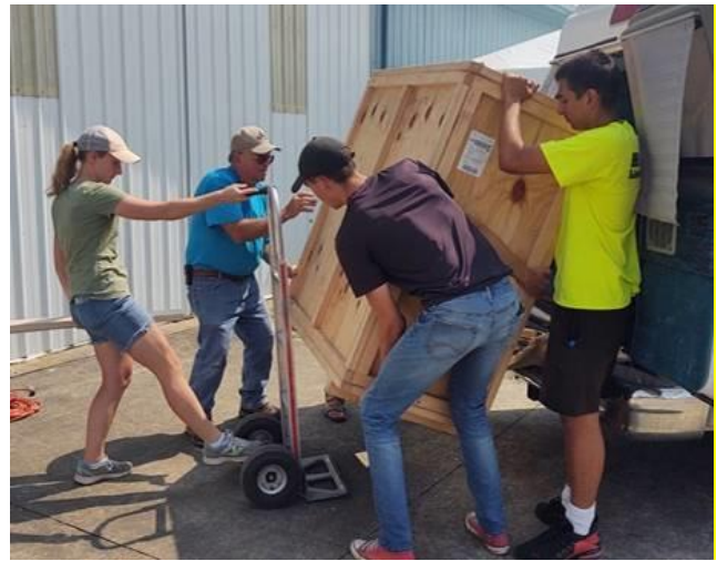
Unloading the kit Sunday afternoon