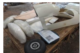
The kit has a lot of included components!