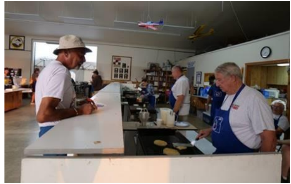
The Pancake breakfast was a big success!