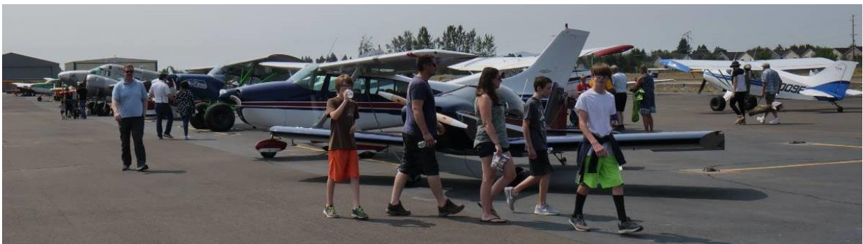
Despite all the social & weather the obstacles, we had a good turnout!