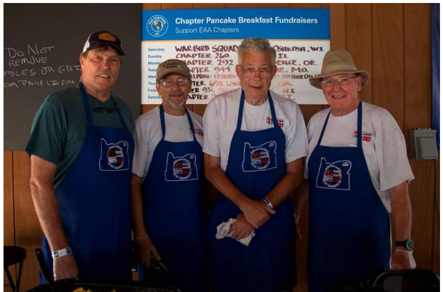
The kitchen and serving crews.