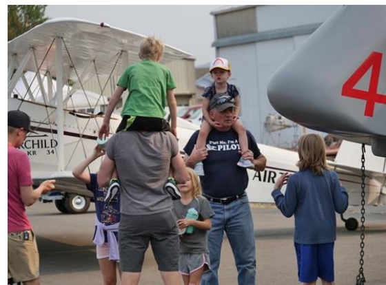
Everyone old and young enjoying airplanes.