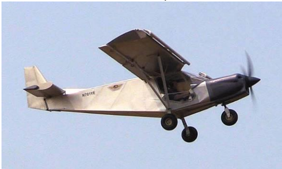
Bill McLagan and the Youth-Built Z-701

Because of Covid, the normal content of forums and activities were eliminated. Instead the Chapter introduced the idea a “fly-bys” where Chapter members could volunteer to show-off their aircraft. One-by-one, there were a dozen members aircraft that took off, flew 2 circuits of the pattern and landed. This gave us an opportunity to also capture some photos and video of the aircraft. These fly-bys seem to be a hit with both attendees and the pilots alike!