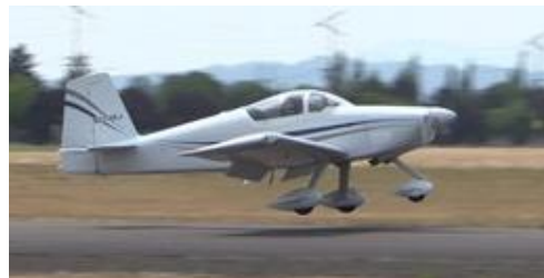
Al Cleveland demonstrated the RV-7