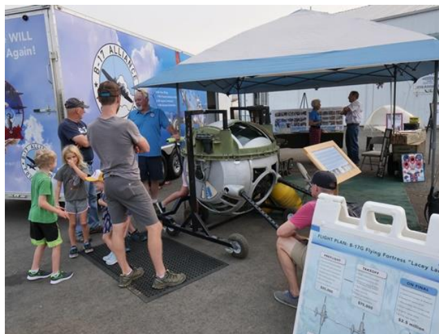
The B-17 Alliance brought over their turret display which was a big hit for visitors!